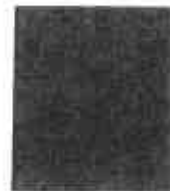
Rich Bitch: Some pics of