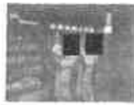
and sister in training at the Wee-Bang Yoo school of geisha